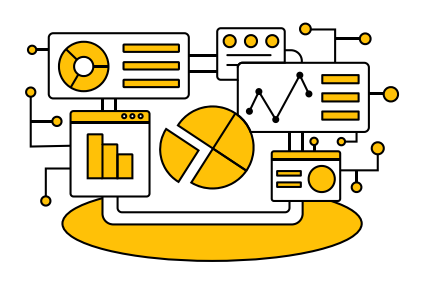
Big Data and Analytics