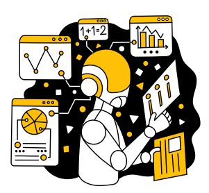
AI & Machine Learning