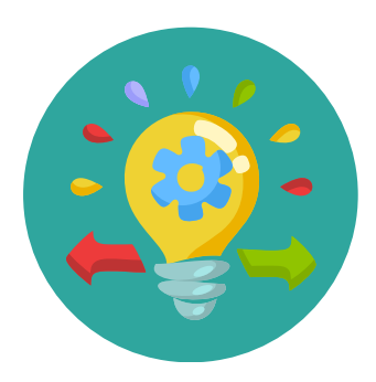
Pivot Tables & Macros