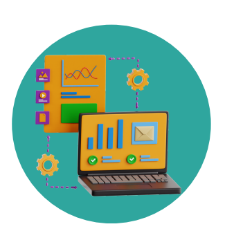
Complex Formulas & Data Analysis